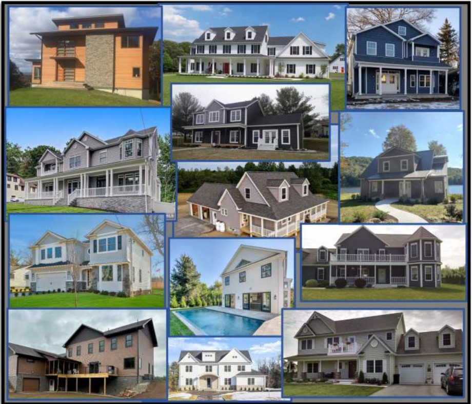
The above images are modular single-family homes constructed and installed in various locations in the United States.

Can you tell that these are modular homes?