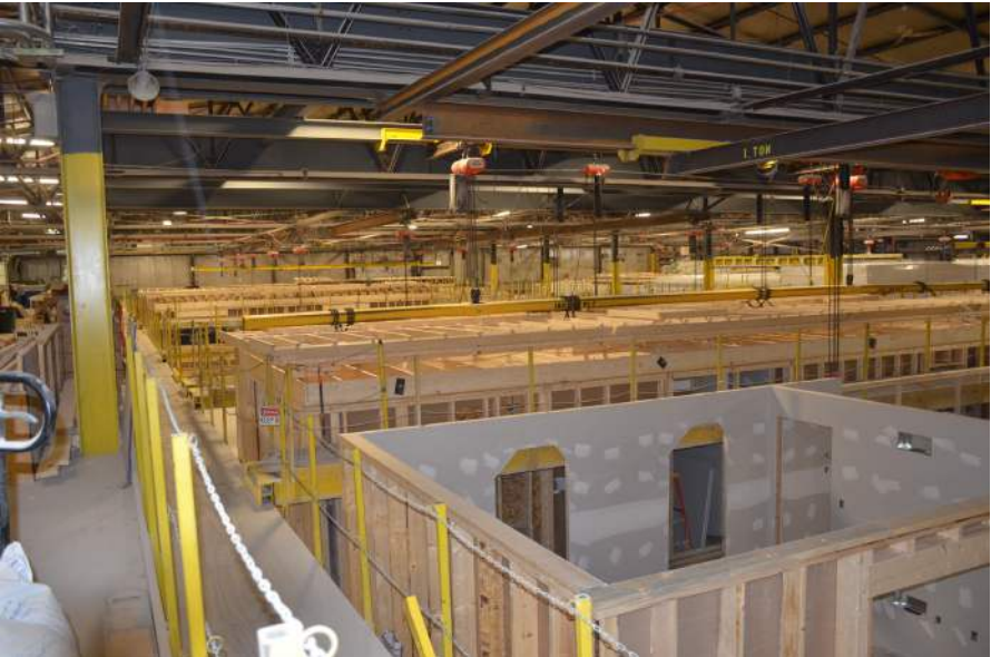
Modular Manufacturing Facility – Custom Building Systems of PA

The construction of your modular home begins in a manufacturing facility, where advanced systems are used to ensure precise off-site assembly of the individual components that will comprise your new residence. The controlled environment of the facility and the use of cutting-edge technology allow for the assembly of up to 90% of the home's materials, fixtures, and components. It's a level of precision that's difficult to achieve with traditional on-site construction methods.